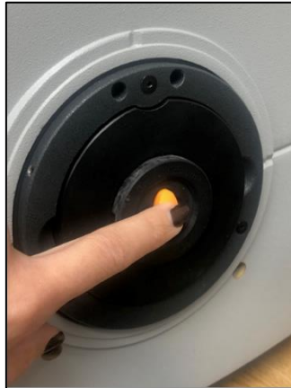
Holding Sample in Place