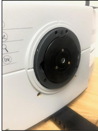
CMR-3237 SAV Port Plate

Note: This aperture has an opening that is smaller than the usual reflectance port opening. Performance specifications (i.e. Factory-supplied color values, stability, accuracy, etc.) are based on the standard 1-inch round transmission port opening. These specifications will not be met with the aperture in place.