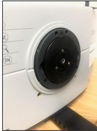
CMR-3237 SAV Port Plate

Note: This aperture has an opening that is smaller than the usual reflectance port opening. Performance specifications (i.e. Factory-supplied color values, stability, accuracy, etc.) are based on the standard 1-inch round transmission port opening. These specifications will not be met with the aperture in place.