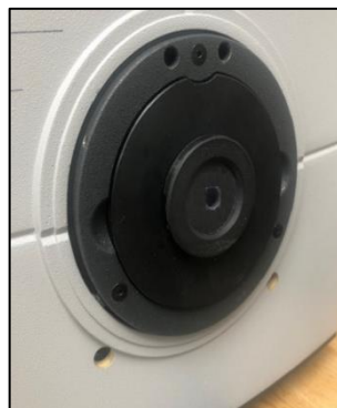
CMR-3237 SAV Port Plate with CMR-3235